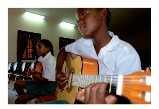
Vlakteplaas became the first rural school to teach music; the essential magic to enhance kids' development. At year's end we'll have a full performing orchestra.