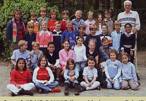
Ons sê "BAIE DANKIE liewe kinders van Zeist!"

n 2005 the Dutch school Zeister Schoolvereeniging celebrated its 75<sup>th</sup> anniversary.