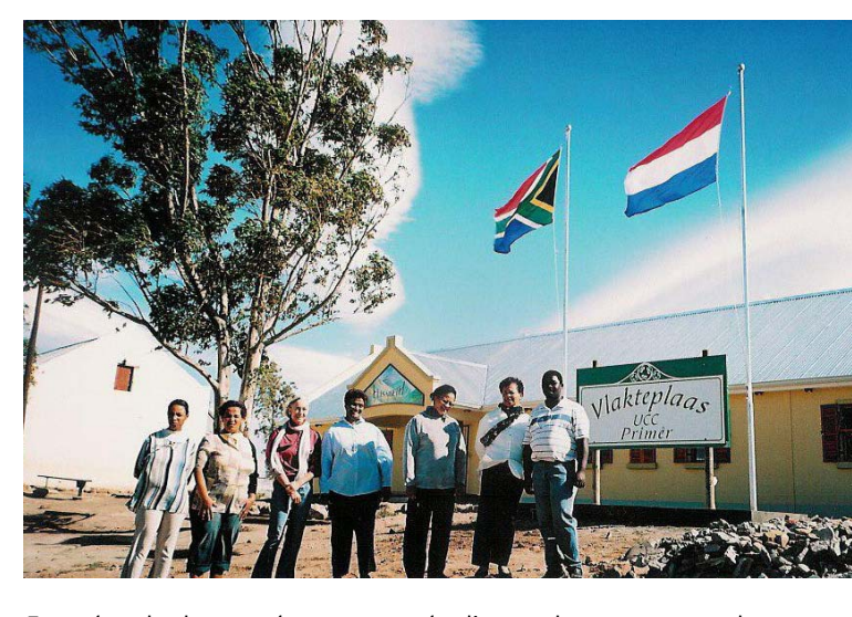
For a hundred years there were only distant dreams scattered among weather-beaten stones on barren Karoo earth; now the South African and Dutch flags herald the birth of a new future.