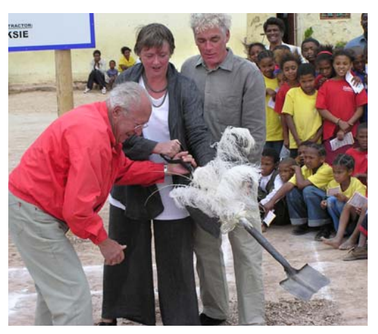
Turning the first sod!

Tens of skilled bricklayers, carpenters, and plasterers as well as local labourers arrive daily to work with vigour and joy under a blazing Karoo sun. Huge trucks with massive loads of brick, sand, stone, cement, roof beams, ceilings, and evermore sand and cement arrive on the hour.