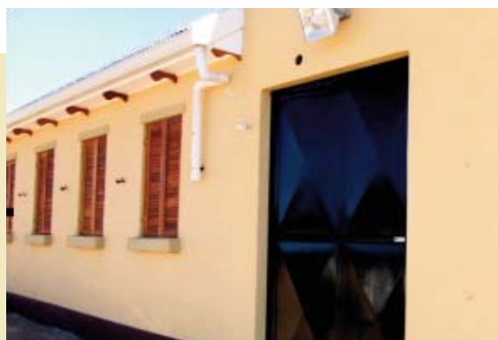
Cold & storage facilities - exterior security entrance