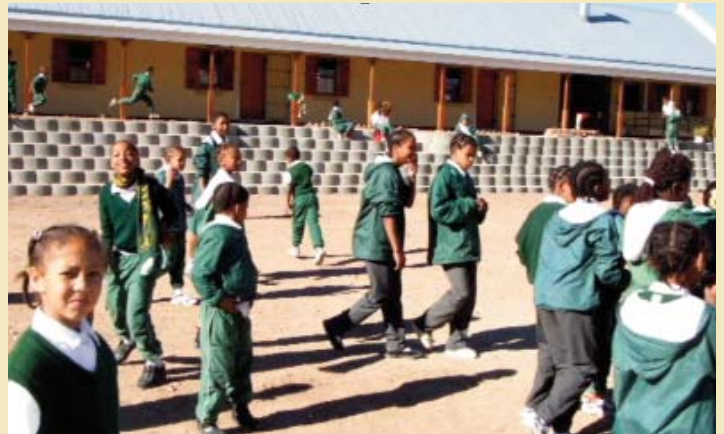
Class rooms and retaining wall