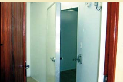
Double entrance to refrigerated facility