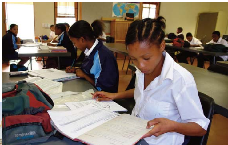
The after school homework class and its participants.

The building of an all weather paved basketball court will start within the near future.