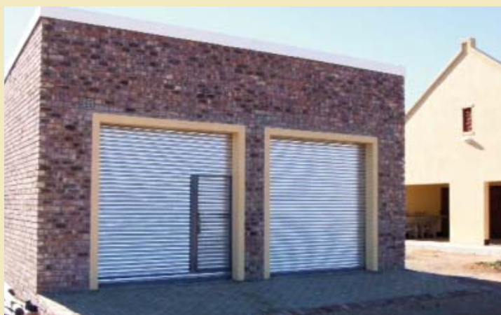
Double garage with security doors