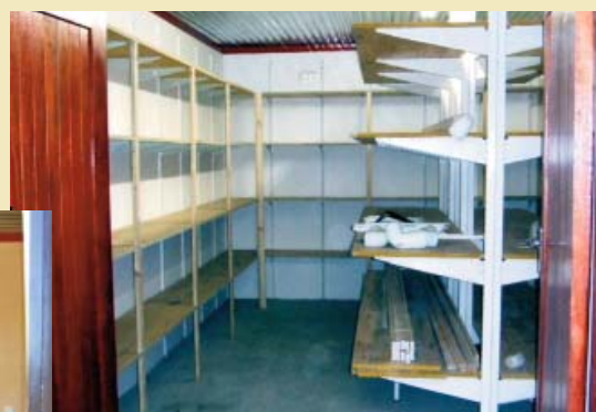
Partial interior storage facility